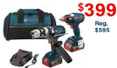
18V Brushless Combo Kit 1/2" Hammer Drill plus 1/4" & 1/2" socket-ready Impact Driver (CLPK224-181)