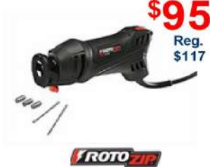
Rotozip Spiral Saw 5.5 amps (SS355-10)