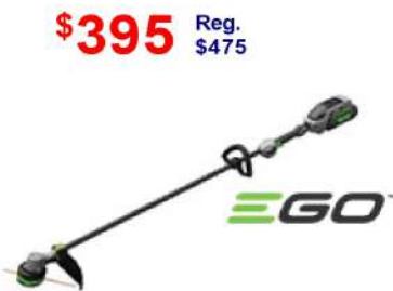
15" 56V Cordless String Trimmer Kit Powerload string trimmer with carbon fiber shaft. 2.5Ah battery & charger included (ST1524)