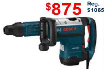
SDS Max Demolition Hammer 14.5 amps, 9.6-ft.lbs. impact (DH712VC)