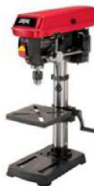
10" Portable Drill Press with Laser (3320-01)