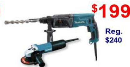
15/16" Rotary Hammer & 4-1/2" Grinder Combo HR2470 & 9557HPG combo (DK0033G)