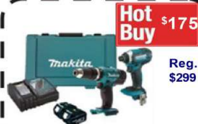
2-Pc. 18V Combo Kit Hammer Drill & Impact Driver combo, 1.5Ah batteries (DLX2142Y)