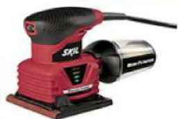
1/4" Sheet Palm Sander, 2 Amps (7292-02)