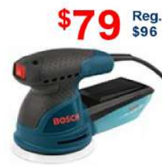
5" Random Orbit Sander 2.5 amps (ROS10)