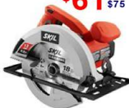
7-1/4" Circular Saw, 13 Amps (5080-01)