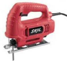
Variable-Speed Jigsaw, 4.5 Amps (4295-01)