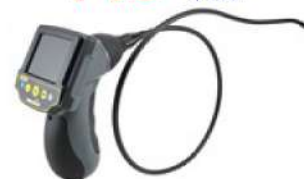
Wi-Fi Video Inspection Camera (TS03)