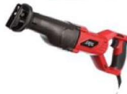
Reciprocating Saw, 9 Amps (9216-01)