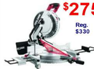
12" Compound Miter Saw w/ Laser, 15 Amps (3821-01)