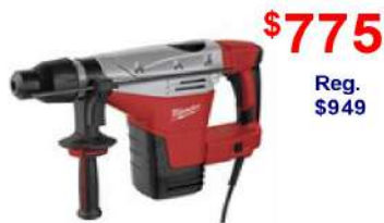
1-3/4" SDS Max Rotary Hammer Includes free 1/2" hammer drill & chisels (5426-21)