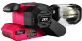
Belt Sander 3"x18" (7510-01)