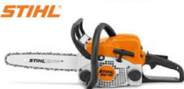
16" Chainsaw Lightweight gas engine, 30.1cc, 1.3 kW (MS170)