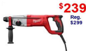
1" SDS+ Rotary Hammer Includes free 1/2" hammer drill & bits (5262-21)