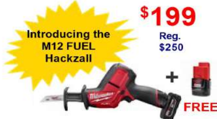
M12 FUEL Hackzall Fastest cutting & most powerful saw in its class. Includes free battery (2520-21XC)