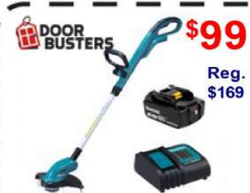
18V String Trimmer Kit 3.0Ah battery & charger (DUR181SF)