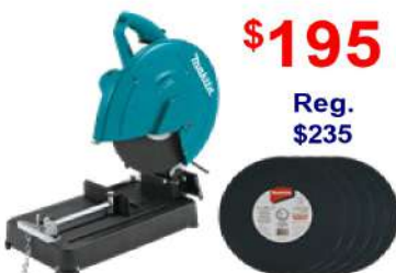
14" Cut-Off Saw Includes 5 free cut-off wheels (LW1401X)