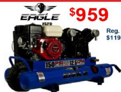
5.5HP Honda Wheelbarrow Compressor Gas engine, 10-gal. twin tank (TT55G)

The Best Prices of the Year Are for 2 Days Only!