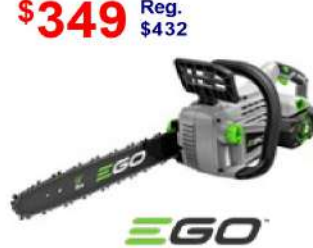
16" 56V Cordless Chainsaw High-efficiency brushless motor, 5.0Ah battery & charger included (CS1604)