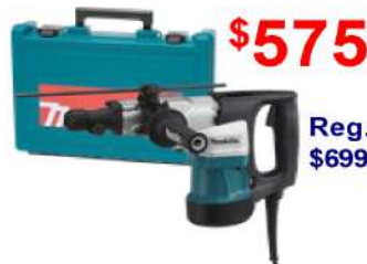
1-9/16" Rotary Hammer Cayman's BEST-SELLING rotary hammer. Spline bit, 12 amps (HR4041C)