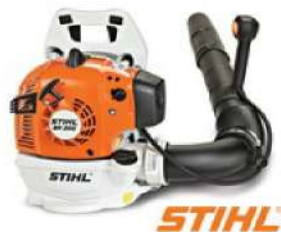
Backpack Blower 150MPH professional caliber designed for home use (BR200)