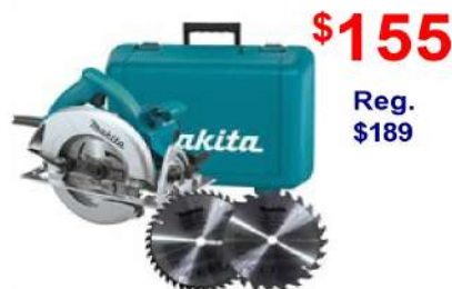
7-1/4" Circular Saw With 2 blades & case (5007NKX)