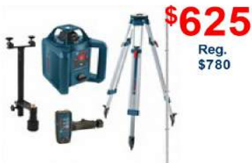
Self-Leveling Rotary Laser Kit Horizontal & vertical, indoor & outdoor (GRL245HVCK)