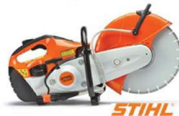
14" Gas Cutquik Saw 4.9" cut depth, X2 air filtration system, 24-oz. fuel capacity (TS420)

STIHL AUTHORIZED DEALER WITH FULL MANUFACTURER WARRANTIES