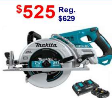
7-1/4" 36V Rear Handle Saw Includes dual charger & two 5Ah batteries (DRS780Z)