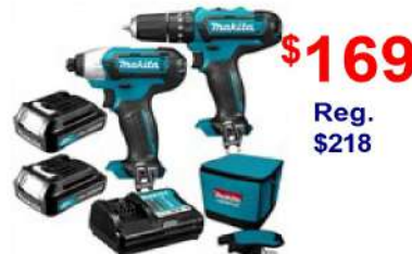
2-Pc. Combo Kit 12V 12V Hammer Drill & Impact Driver combo (CLX202)