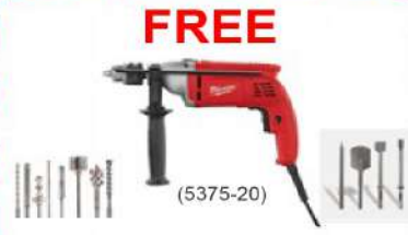
1/2" Hammer Drill & $50 in bits & chisels with purchase of any featured rotary hammer