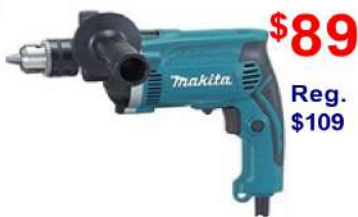
5/8" Hammer Drill With 9-pc. drill-bit set (HP1630X)