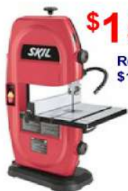
9" Band Saw, 2.5 Amps (3386-01)