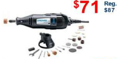
Dremel Rotary Tool Kit Two speeds, 15-35,000RPM (200-1/21)