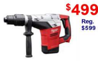
1-9/16" Spline Rotary Hammer Includes free 1/2" hammer drill & bits (5316-21)