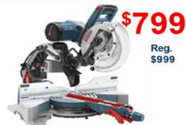
10" Dual-Bevel Glide Miter Saw (CM10GD)