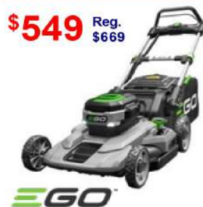
21" 56V Cordless Mower 45-minute cut time, rapid 40-minute charge time. 5.0Ah battery & charger included (LM2101)