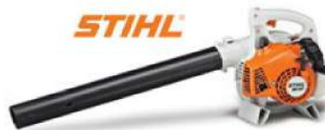
Gas Handheld Blower Highest power-to-weight ratio by Stihl, 134MPH, 7.9 lbs. (BG50)