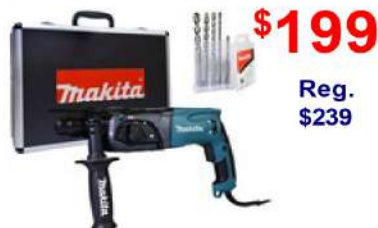
Rotary Hammer with Aluminum Case & 5-Pc. Bit Set 15/16" 3 modes (HR2470X6)