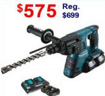
36V Rotary Hammer 26MM Includes dual charger & two 5Ah batteries (DHR263Z)

MAKITA 36V = the power of electric and the convenience of cordless