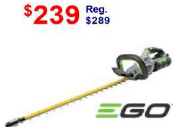
24" 56V Cordless Hedge Trimmer Kit World's first cordless trimmer with 1" cut capacity. 2.5Ah battery & charger included (HT2411)