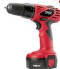
3/8" 12V Cordless Drill/Driver (2240-01)