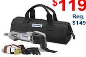
Multi-Max Oscillating Tool Kit 3.3-amp variable speed (MM30-04)