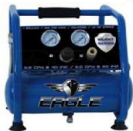
Silent Series Compressor, 1 Gal. Ultra-quiet operation, oil-free double piston pump (EA-3000)