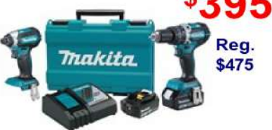
18V Brushless 2-Pc. Combo Kit Hammer Drill & Impact Driver combo, 4Ah batteries (DLX2180MX)