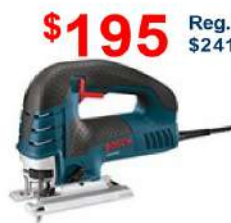
7-Amp Jigsaw Variable speed (JS470)