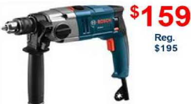
8.5-Amp Hammer Drill 1/2" heavy duty (HD18-2)