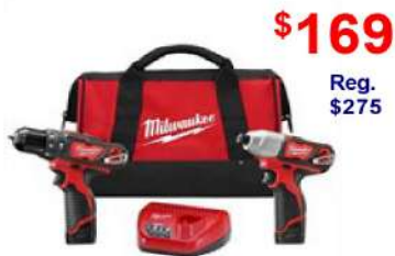
M12 2-Tool Combo Kit Hammer Drill & Impact Driver, 2 batteries, charger, & case (2497-22)