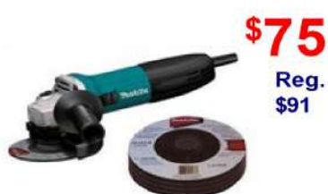
4-1/2" Angle Grinder With 4 free grinding discs (GA4530X2)