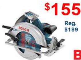
7-1/4" Circular Saw 15 amps, 5,600 RPM (CS10)