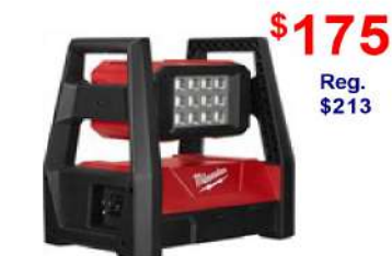
LED Job-Site Light 2,000 lumens, corded or M18 battery (2360-20)