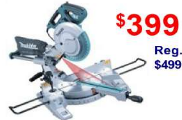
10" Slide Compound Saw w/ Laser Direct-drive motor, 4,300RPM (LS1018L)

MAKITA 36V = the power of electric and the convenience of cordless