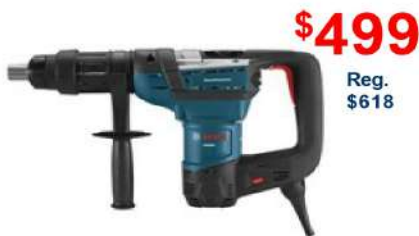
1-9/16" Rotary Hammer 12-amp spline bit (RH540S)