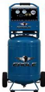
Silent Series Compressor, 20 Gal. Ultra-quiet operation, vertical with wheels (EA-6500)