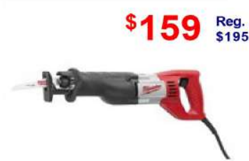
Reciprocating Saw, 12 Amps Toolless blade change, case included (6509-31)