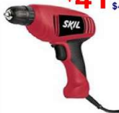
3/8" Variable-Speed Drill, 5.5 Amps (6239-01)