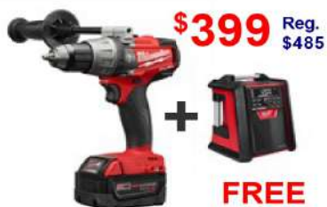
1/2" Hammer Drill 18V FUEL (2704-22) Includes FREE job-site radio (2792-20)