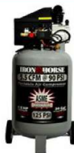
Vertical Compressor, 20 Gal. 1.5HP, 2-wheel roll-around (IHVP1520L)